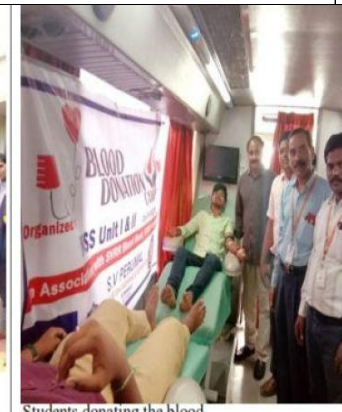
Students donating the blood