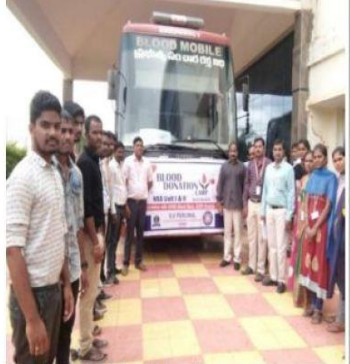
Blood Mobile at Blood donation camp