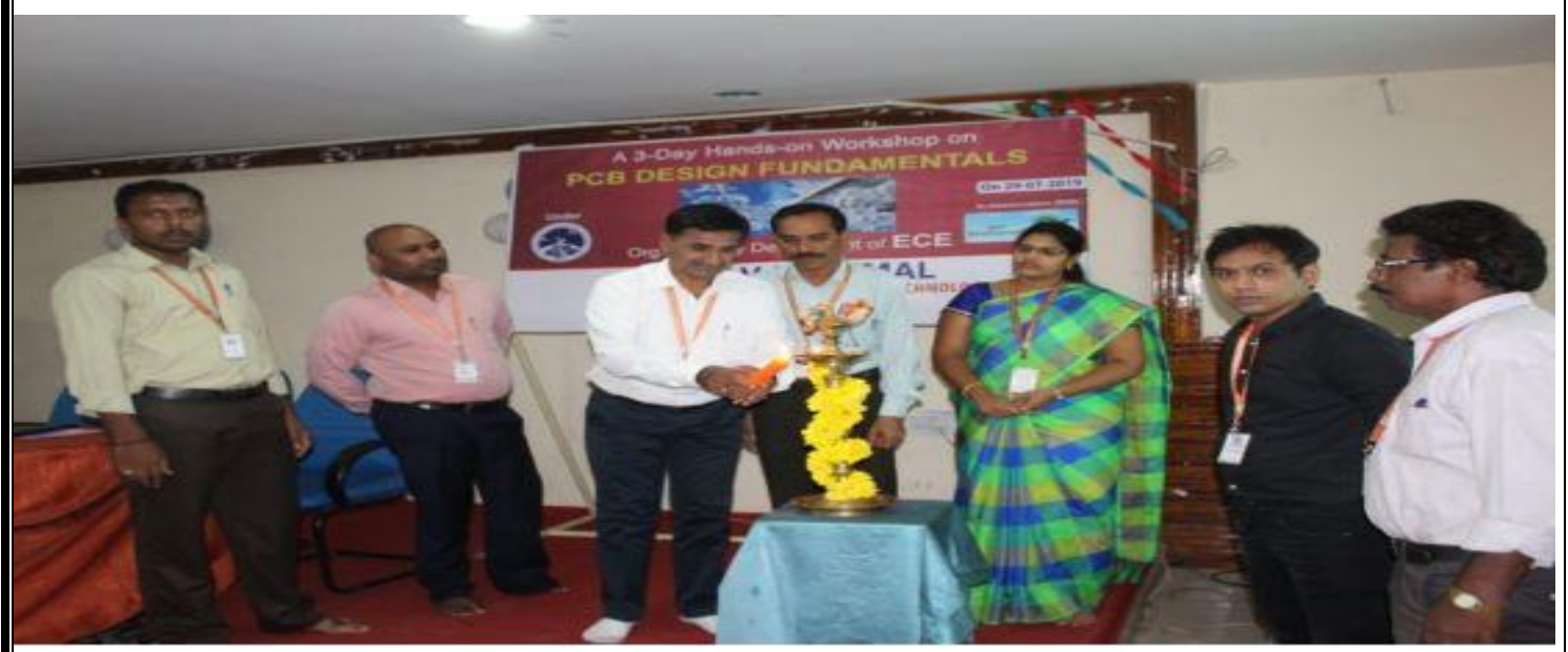
The indispensable and pervasive knowledge of electronic circuits will give the students an insight to their practical approach and also evokes innovative thinking.

Department of Computer Science & Engineering, SVPCET Newsletter: July–December (2020-21) Volume:01 Issue:1 Newsletter: July–December (2020-21) Volume:01